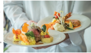
Regularly inspired cuisine

Virginia Woolf said it best, "One cannot think well, love well, sleep well, if one has not dined well." This phrase epitomizes AmaWaterways' dining philosophy. While sailing Europe's legendary rivers, you'll be tempted by a veritable smorgasbord of exquisite cuisine. AmaWaterways' menus balance mouthwatering regional dishes and time-honored gastronomic favorites served with fine local wines, so you can enjoy Austrian Griller Vöthliner with Wiener schnitzel as you cruise the Danube and drink full-bodied reds with heavy pinot-noir while visiting Bordeaux, France.